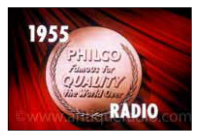
Radio Title Slide

Look for more in the future. And, remember, you can see these in full color on the A.R.C. website. Coming up, we hope to have the entire slide show on the site.