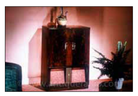
Model 1755 Closed – Hi-Fi system's attractive cabinetry.