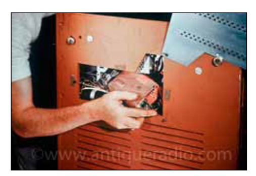
UHF Tuner – Close up of the optional new UHF frequency tuner.

Inserting UHF Tuner – A service tech installing the optional UHF frequency tuner.