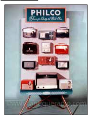
Radio Merchandiser – Point of sale display showing 12 of the latest Philco radios.