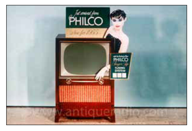
Finger Tip Wrap – Point of sale display illustrates the "exclusive" new finger tip tuning system.