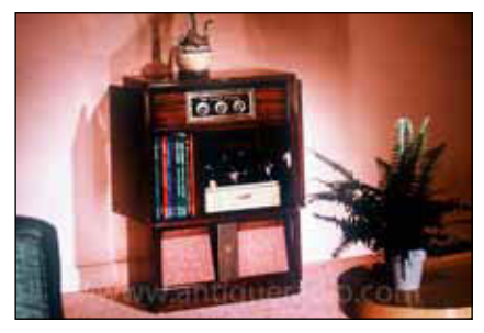
Model 1755 Open – Hi-Fi system consisting of three-speed record changer and a three-tube, 6 watt audio amplifier.

Original Philco Slide Box - Where it all started.