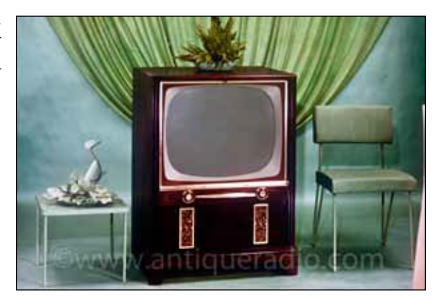
Model 6112 – TV with 24inch CRT and new "Finger Tip Tuning System."