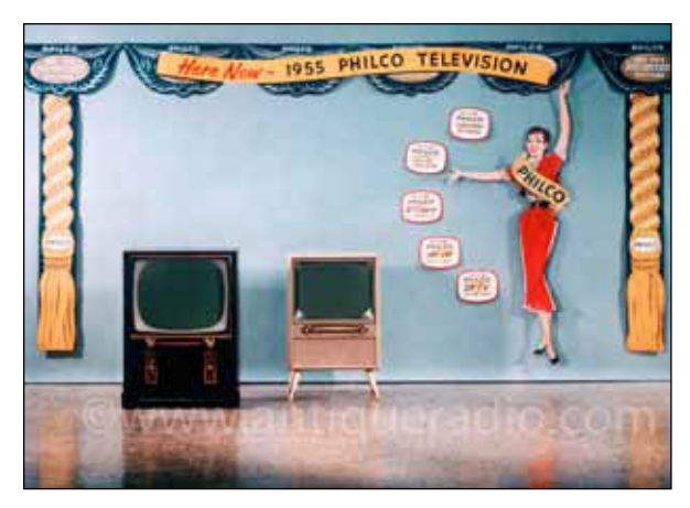
TV Window Kit – How a store window display should be set up to promote TV sales.