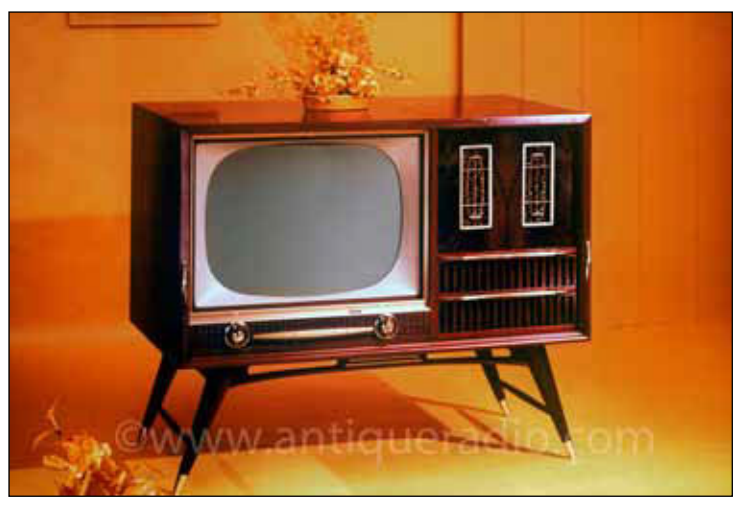
Model 4412 – TV with 21-inch CRT, three-speed record changer, and AM radio. Record changer is concealed in a pull-out drawer and the radio is hidden under a panel on the top.