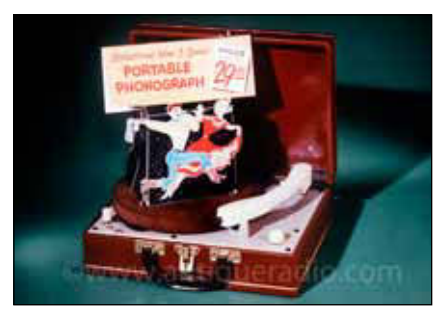
Model 1332 Turntable Display – How to set up in-store display, explaining the three-speed feature and $29.95 price. Amplifier consists of one tube.

...find out how by visiting us today at www.antiqueradio.com.